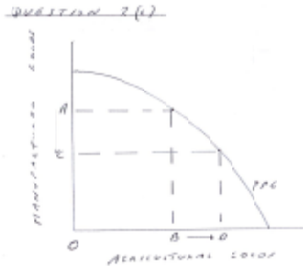
Diagram – 3 marks