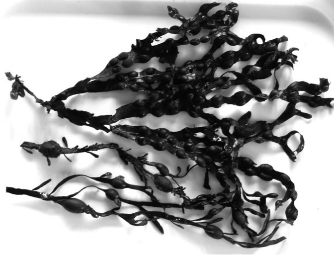
Fig. 1.1 magnification \times 0.3

An investigation was carried out to measure the distribution of two species of brown algae, Ascophyllum nodosum and Pelvetia canaliculata , on a rocky shore.